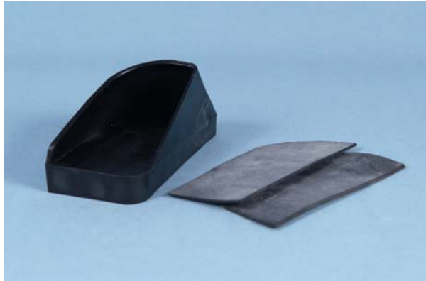
Rubber insoles which are made from tire inner tubes, cushion sole on thin sole claws.

Still a step ahead of the rest of the field!