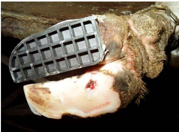
Cowslip applied to the healthy claw to relieve weight bearing on claw affected with sole ulcer.