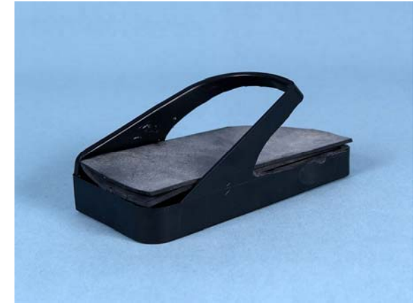
Cowslip modified into a sandal for greater heel support when applied to claws with abnormal toes (screw claws).