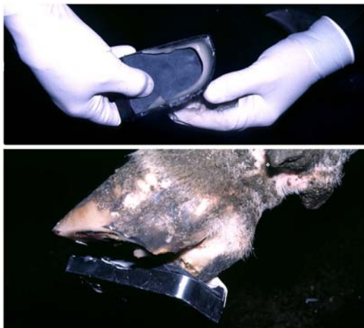
Glue application to inner wall of Cowslip . Cowslip applied to claw with thin sole.

Adapted from the ABSTRACT presented in Parma, Italy at the XI International Symposium by T. Rollins, Alliance Dairy, Inc.