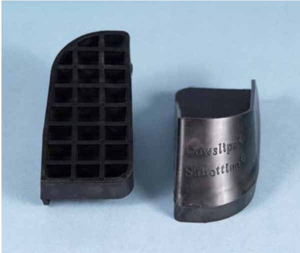
Cowslips Plus with a lattice sole.

Keeping Cowslips warm helps maintain rapid curing of adhesive. Heat lamp keeps Cowslips warm and flexible in cold weather conditions. Warmed Cowslips are easy to modify for special applications.