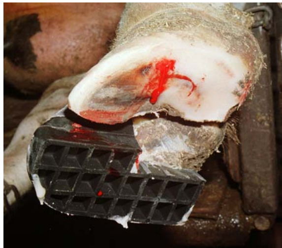
Cowslip applied on claw with early sole ulcer. Opposite claw with more advanced sole ulcer.