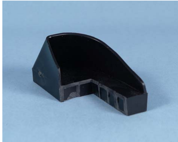
Cowslip modification for conditions where there are lesions in both claws.